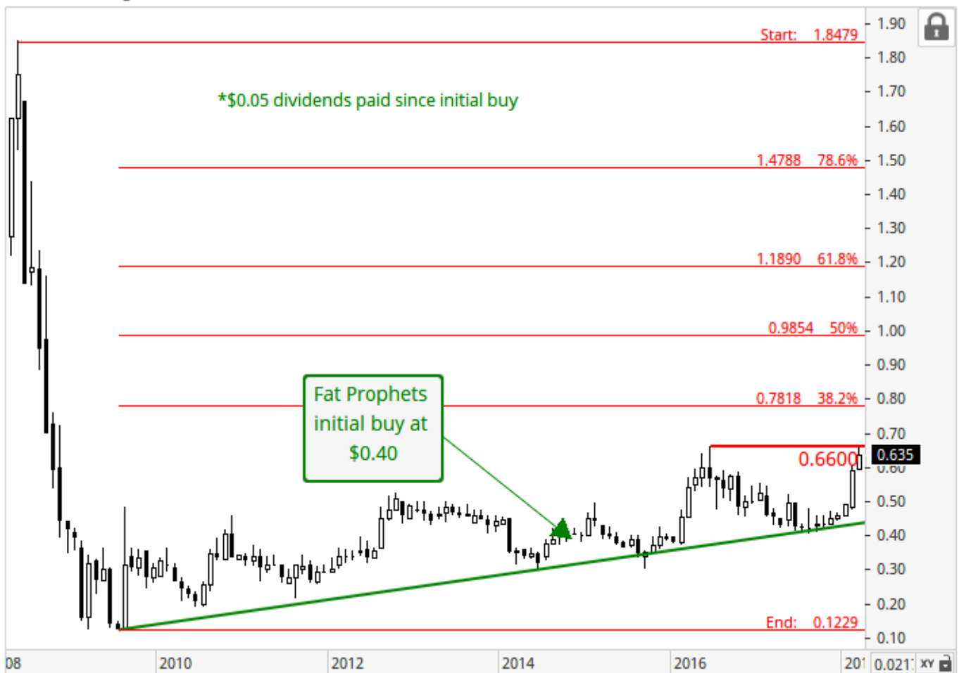
Australian Vintage Limited - AVG (ASX) - 1 Month CandleStick Chart - AUD

Turning to the charts and prices in recent months have pushed upward from the long-term uptrend line, and dynamic support. After such a strong rally some consolidation is potentially on the cards, and with overhead resistance around the $0.66 mark.