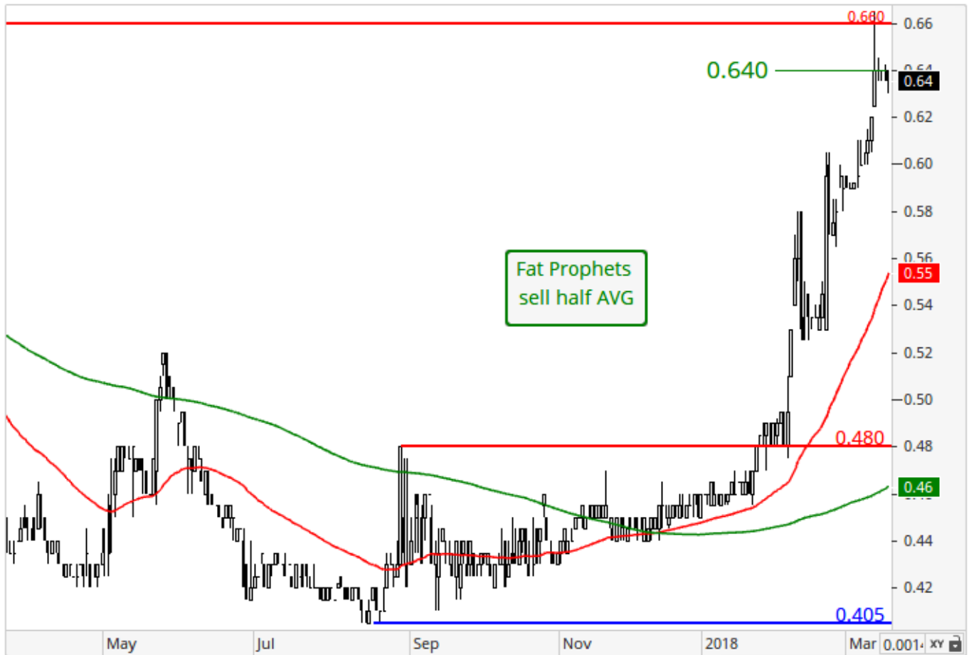
Australian Vintage Limited - AVG (ASX) - 1 Day CandleStick Chart - AUD

On the valuation front, the company's shares are trading at a price of FY18 multiple of 24 times which, compared to sector multiple of 20.7 times, implies that much growth is already priced in. With that said, we recommend that Members should take this chance to take profits and SELL HALF their Australian Vintage shares around current prices.